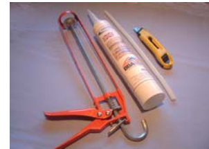
ALL YOU NEED FOR EFFECTIVE DPC INTALLATION