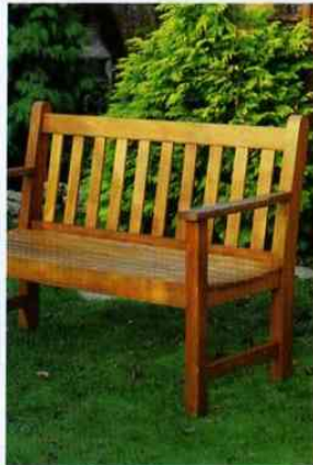
Garden and indoor furniture...